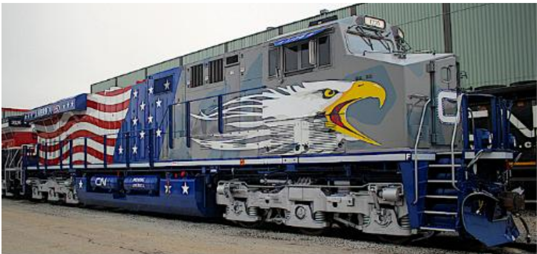
CN 1776 Locomotive