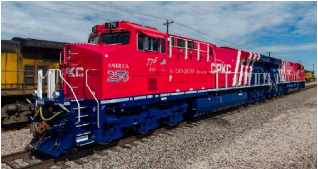
CPKC #776 Locomotive