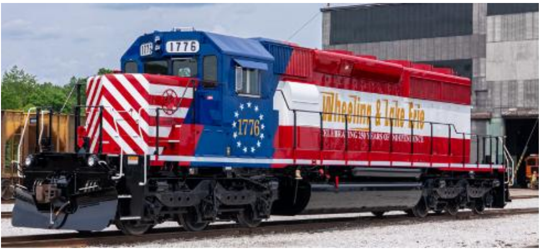
Wheeling & Lake Erie #1776 Locomotive