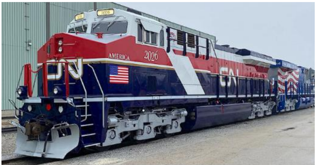
CN 2026 Locomotive