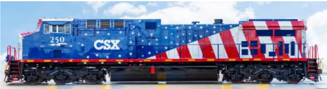
CSX #250 Locomotive