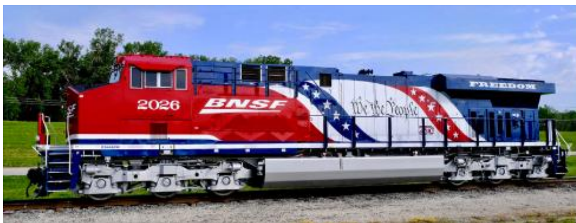
BNSF 2026 250th Anniversary Locomotive

In my opinion, this year and into next year will be like nothing we've seen or experienced before as modelers. With the celebration of America 250, it seems that every single railroad is custom painting engines and cars for the celebration. So it's a certainty that all of the model manufactures are going to be pre-ordering and rushing to get all of these brand new paint schemes produced so that they can all cash in on this once-in-a-life time event.