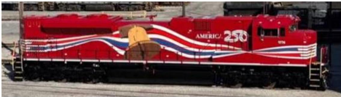
NS 1776 Locomotive

Even as I type this article, Union Pacific Big Boy 4014 has Norfolk Southern 1776 in it's consist.