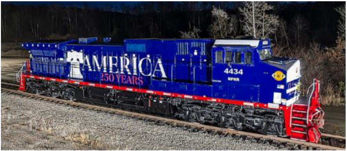
Buffalo & Pittsburgh #4434 Locomotive