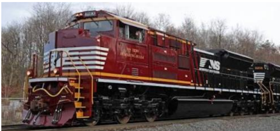
NS 1230 Locomotive

And if that weren't enough right now, we also we have the potential merger with Union Pacific and Norfolk Southern. We all know that could potentially lead to additional paint schemes or heritage units.