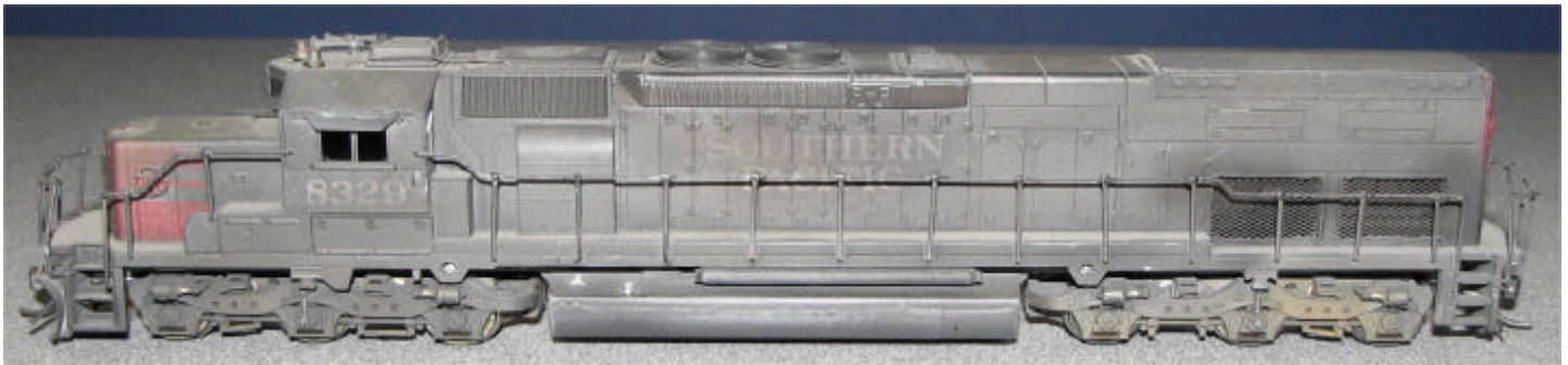
Second Place - Bill LaFollette