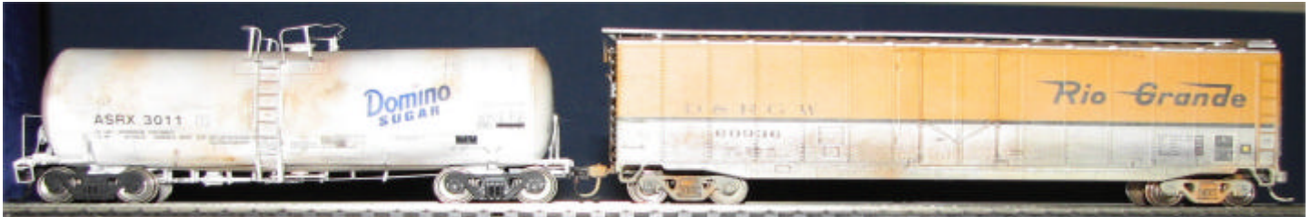
First Place - Jerry Bonds