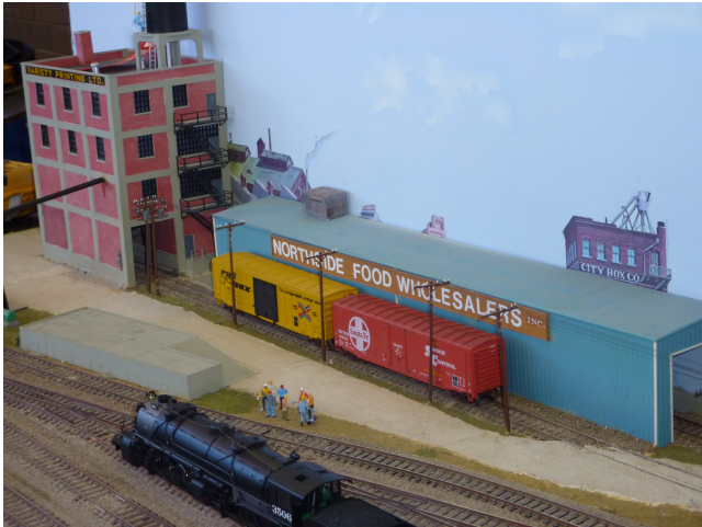
Northside Food Wholesalers on Charles' modules.