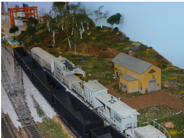
Coal train and maintenance of way trains on Adam and Dusty's modules at Slim Rails show.