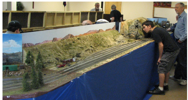
Myron's Modules at the division train show.