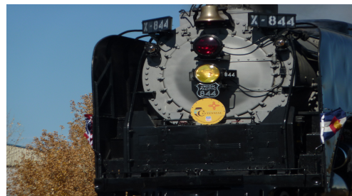
UP 844 pass by soccer fields off Mark Dabbling