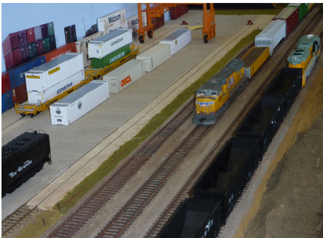
Container yard on Charles' modules at the Slim Rails train Show.