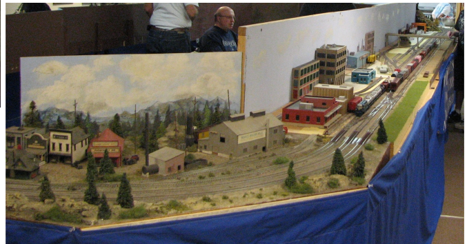
Corner modules and Charles' modules at the division show.