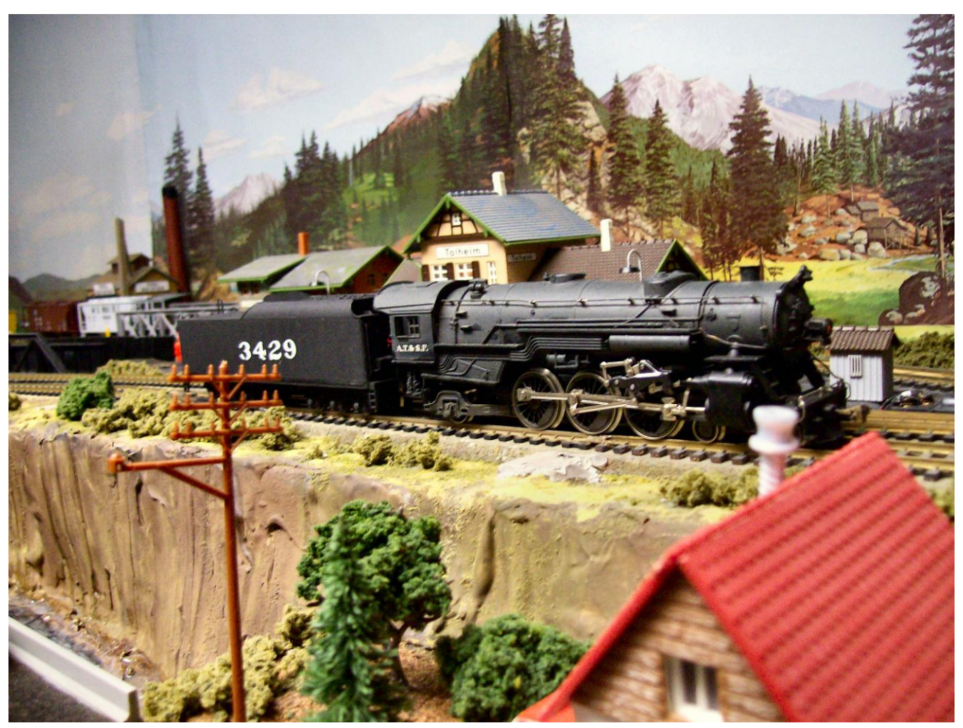
ATSF Pacific #3429 at Talheim

After all the trauma, it ran well enough to make it to Talheim Station.